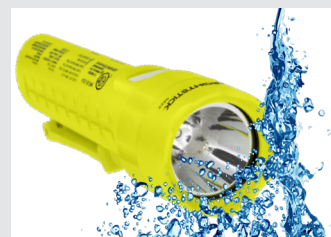
Durable polymer body is impact & chemical resistant