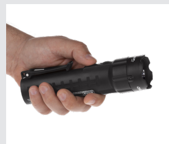
Large, textured buttons