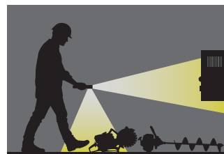
Simultaneous flashlight and floodlight operation